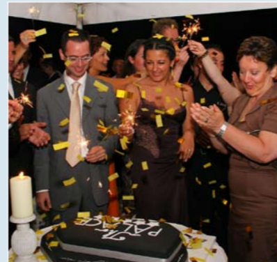
Malta meets Asia

The Palace celebrated its 2nd Anniversary with a big themed event named "Malta meets Asia", where guests were treated to a fusion of Maltese and Asian food on The Palace's spectacular TemptAsian terrace, whilst enjoying breathtaking views of Valletta on one side and Sliema / St. Julian's on the other. This event also served as the AX Hotels' Annual trade party. Awards were given to the best performing companies in terms of room nights for 2008.